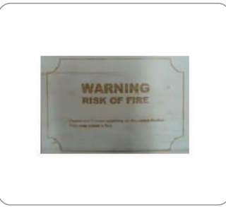
Sauna Warning Sign