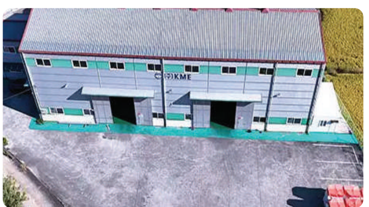
Gimhae (Office/factory) 25, Seobu-ro 1331beon-gil, Juchon-myeon, Gimhae-si, Gyeongsangnam-do, South Korea

Busan (Head Office) 29, Nakdong-daero1302 beon-gil, Sasang-gu, Busan, South Korea