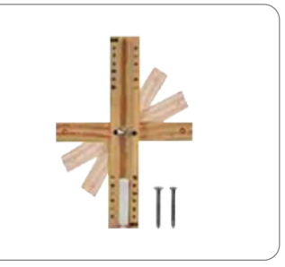
Sauna sand timer